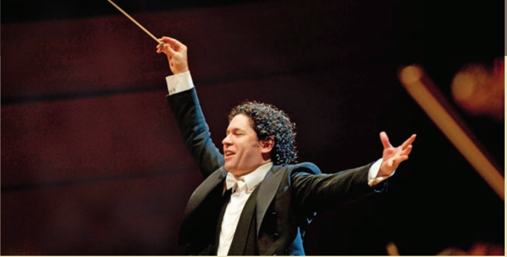
Gustavo Dudamel, music director of the Los Angeles Philharmonic, conducted the MIT Symphony Orchestra when he was the Institute's McDermott Award winner.